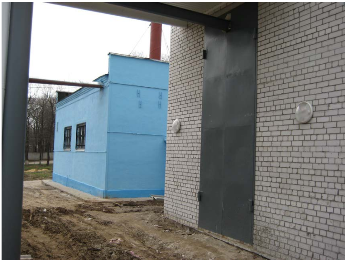
Booster station/installation site