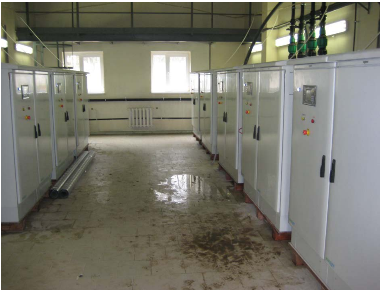
Envirolyte ELA-24 000ANW machines